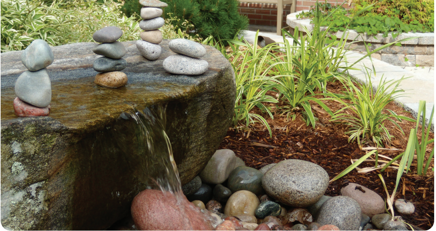
Pictured here: The Healing Garden at Cooley Dickinson Hospital offers a tranquil sanctuary for patients, visitors, and staff.